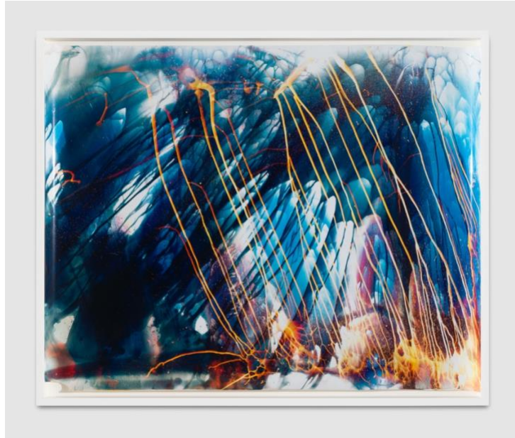
Mariah Robertson, 370 , 2015-22, chemical treatment on RA-4 paper, 38 x 50 in (96.5 x 127 cm)

June 16 - August 19, 2022 23 East 73 rd Street 3rd Floor Gallery