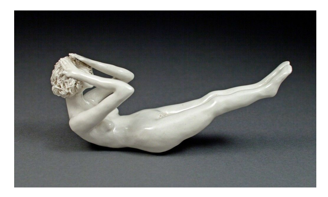
Coille HoovenThe Howl1991Ferrin Contemporary