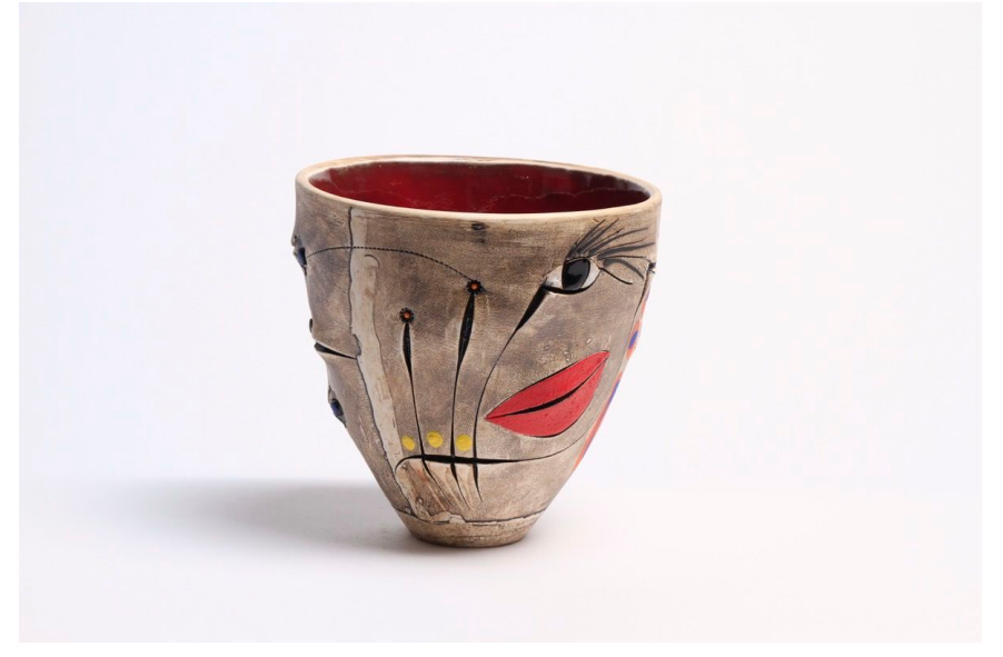
Work by Andile Dyalvane.

B. 1978, Ngobozana, South Africa • Lives and works in Cape Town