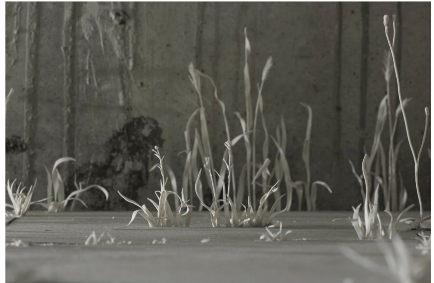
Katie Spragg, Wildness (detail), 2016.