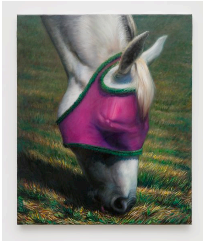
horse (xoox), 2016.

them fantastically, as if to create a stage of foliage for them to pose against. The striking, inorganic sense of symmetry here—the greenery, the weirdly holy animals—recalls nothing so much as the 15th century Adoration of the Mystic Lamb by Jan van Eyck.