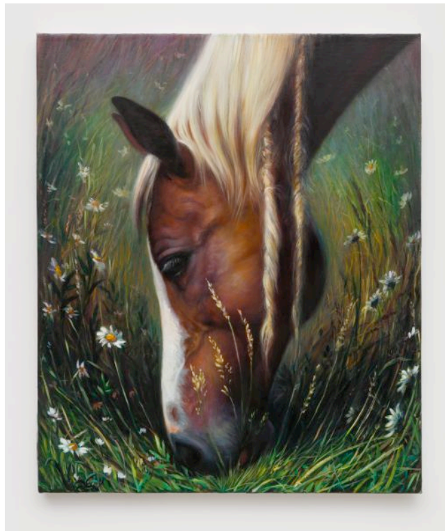
horse (xxx), 2016.

The gallery's front room features a pair of canvases in which horses are standing in bare, anonymous rooms. A slim window interrupts one wall; the horses stare yearningly toward or through this aperture, which allows light to enter the room, fractured into prisms. Small details are important: the swell of ribs beneath fur; one horse's clear, strikingly blue eye. Davy's painterly chops veer toward nearly photographic realism, which only makes the unreality of the setting depicted that much more jarring. Where are we, in this featureless animal jail? Things don't get any clearer. The next painting we encounter is of a single young horse, almost entirely obscured by shadow—he's basically floating in an inky void. I say he comfortably because the horse's gender is pretty apparent, given his prodigious penis, which is loosing a healthy stream of vaguely Mountain Dew-colored urine onto the floor.