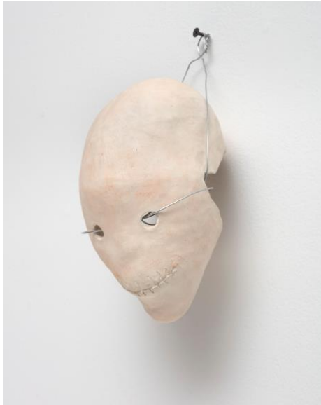
Daisy Youngblood, "Wired Waitress" (1977), signed and dated on skull interior: DY 77, low fire clay and wire, 6 1/4 x 6 1/4 x 4 inches

Two twigs stick out indicating the nostrils. A larger stick pierces the top of the skull and reappears below the chin, while another sharpened stick penetrates the side of the head until it extends out of the other side, hence the work's title.