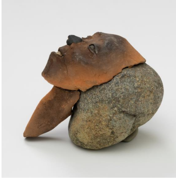
Daisy Youngblood, "Chandrika" (2014), low fire clay and stone, 7 1/8 x 6 1/8 x 9 5/8 inches

Earlier, I described Youngblood as a figurative sculptor, but perhaps it is more accurate to say that she is a portrait sculptor whose themes include the embracing of one's mortality.