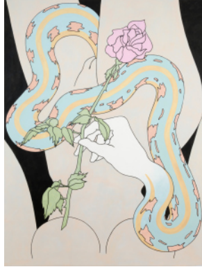
Caitlin Keogh's The Writer , 2014.

Each of her psychologically arresting canvases is themed with the guise of a creative-type ( The Guest-Lecturer , The Illustrator , The Writer ) and Ms. Keogh riffs off the generalities of these caricatures by blending a wide range of dated imagery culled from 1930s women's magazines as source material. The outcome is both gorgeous and grotesque.