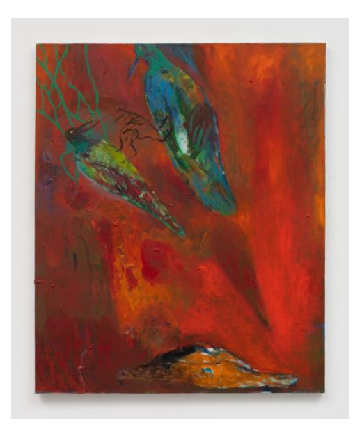
Volker Hüller, Wild at Heart (2021). Courtesy of the artist and Van Doren Waxter.

Volker Hüller, Black Moon (2021). Courtesy of the artist and Van Doren Waxter.