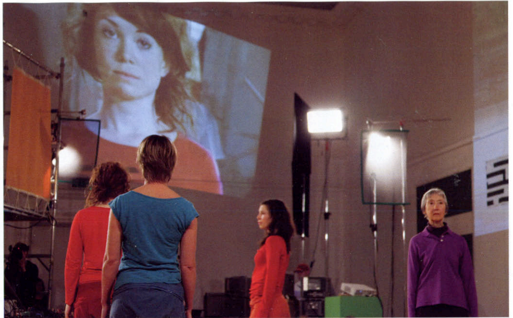
Charles Atlas, Mika Tajima, and New Humans , The Pedestrians , 2011, mixed media. Performance view of Gaby Agis's Navigations , 2011. South London Gallery, April 6, 2011.

MT: The South London Gallery show allowed ten days for filming. That gave us time not only to prepare technical aspects like lighting, and to engage performance collaborators over a longer period, but also to demonstrate various configurations of the space and states of transition.