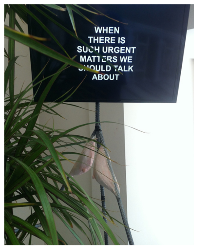
Laure Prouvost, Metal Woman bringing a salty plant upstairs (detail), 2017, video, metal sculpture, plaster boobs and bums, and tree. ©LAURE PROUVOST/COURTESY LISSON GALLERY